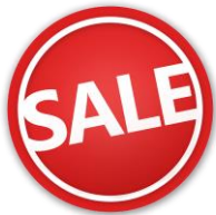
Table-Top Sale at Christ Church Halton